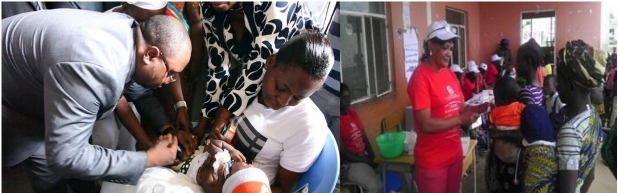
WHO African Region @WHOAFRO Apr 24 Minister of Public Health #DRC vaccinating a child at DRC launch of African #Vaccination Week #AVW #RUuptodate pic.twitter.com/btdtdV4QPv

partnership with @WHOAFRO and @UNICEF launched African #Vaccination Week 2014 today pic.twitter.com/GPXdDKOh4P