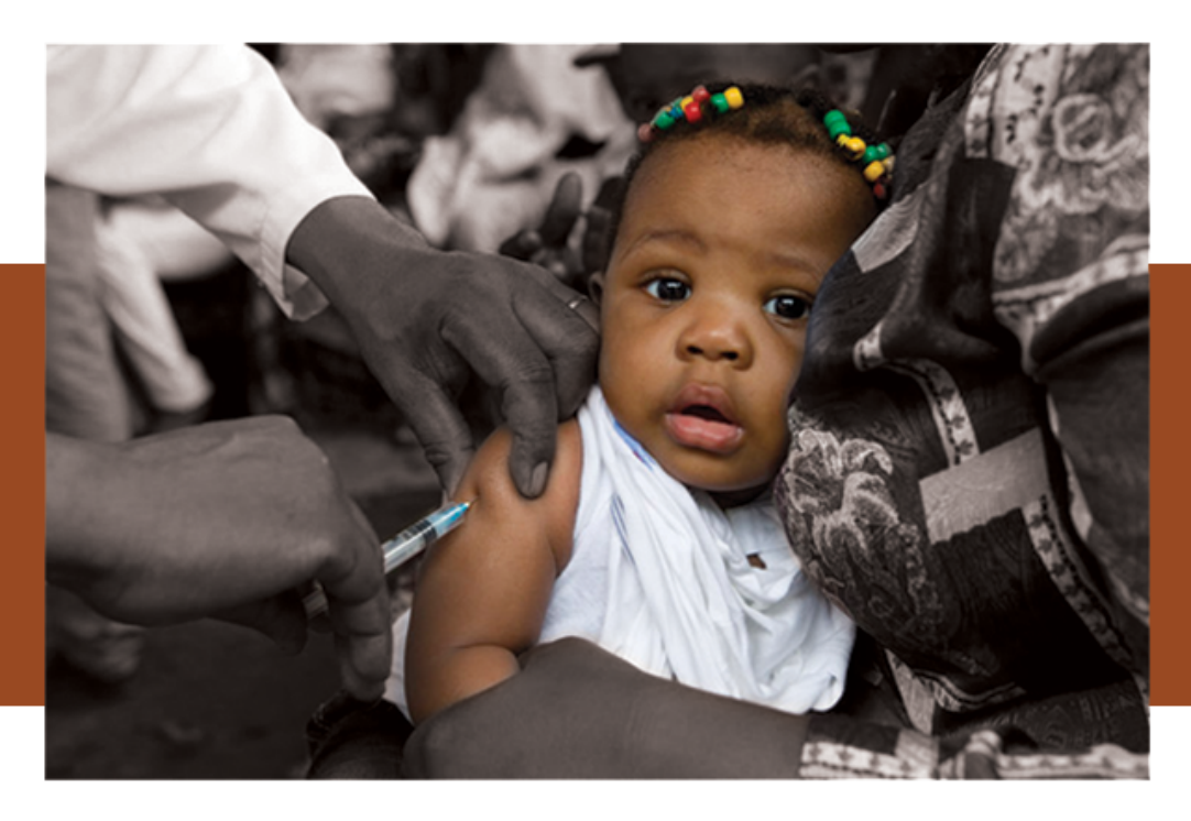
Vaccination, a shared responsibility "