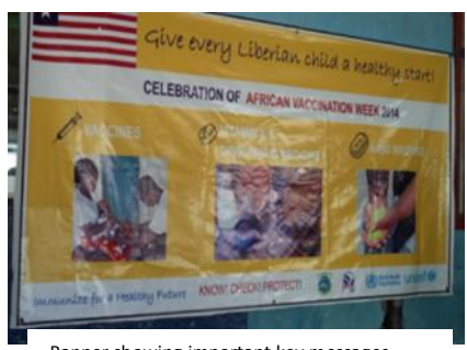
Banner showing important key messages during AVW 2014