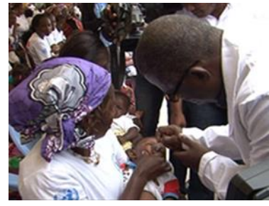
The Minister of Health & Population, Congo, administering rotavirus vaccine