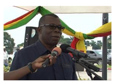
Minister of Health & Population, Congo, launching the regional 2014 edition of AVW