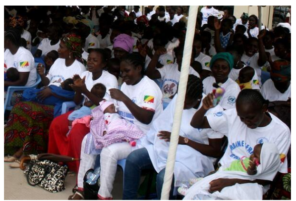
WHO African Region @WHOAFRO Apr 24 Regional launch

Are you up to date? "@WHOAFRO: launch of African #Vaccination Week 2014 at Mfilou Hospital in #Brazzaville, #Congo pic.twitter.com/szSbFCbrL1"