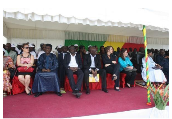
WHO African Region @WHOAFRO Apr 24 Rep. #Congo in