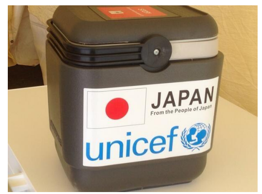
myo-zin nyunt @mznyunt May 14 @UnicefNamibia 1st ever African Vaccination Week launched in Namibia today. Thanks to Japan Government for supplies. pic.twitter.com/nno7rmjVjc

launched in Namibia today. Thx Government of Japan for supplies. pic.twitter.com/JQ70 \sqcup ThPX RESULTS Canada @ResultsCda May 11