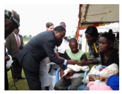
The Minister administering OPV to a child at the launch

The Honourable Minister of Health, Dr Ruhakana Rugunda, officially launched the 4th edition of the African Vaccination Week in Uganda on 24 April 2014, in Sheema district, with a call on parents, communities and leaders to play their roles in immunizing children so as to have healthy communities. The minister stated that the theme for the year, "vaccination, a shared responsibility" was very apt as there was a need for everybody to ensure that children were fully immunized. According to him, everybody had a duty to protect children against vaccine-preventable diseases. The minister also pointed