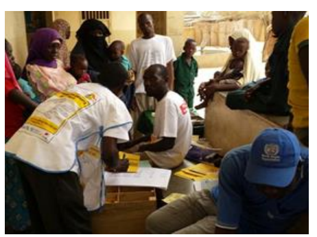
Registration of children at a health facility prior to their vaccination

The 4th edition of the AVW was officially launched on 23 April 2014 in Kinasserom in Bol Region, in the presence of different national and local authorities as well as partners. The Chief of Bol Region, Secretary General of the region, the American Ambassador, WHO and UNICEF Representatives and Secretary General of the MOH made speeches in support of the immunization efforts in the country. This was followed by administration of vaccines, distribution of ITNs and bags to children and women that had completed their schedule.