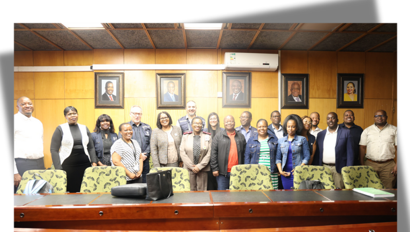
Snapshot from the Health and migration mission