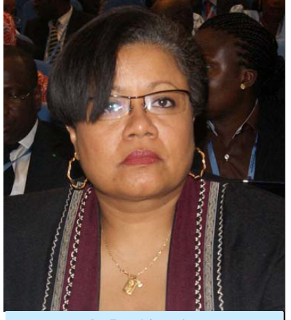
Dr. Erna Athanasius Minister for Health, Seychelles

It is only when they are convinced that they will start looking elsewhere. Only by reducing the demand for alcohol that we will reduce the supply. Demand can only be reduced if through an intelligent and sustained programme of education that starts early and that is overwhelming, in the family, in schools, in the community, in mass media, people are encouraged to turn away from alcohol for good. The same peer pressure that forces many young people to turn to alcohol must be harnessed to educate them to turn away from it.