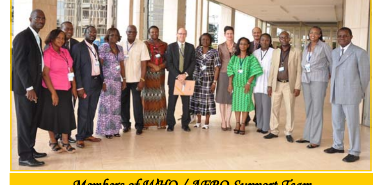
Members of WHO / AFRO Support Team